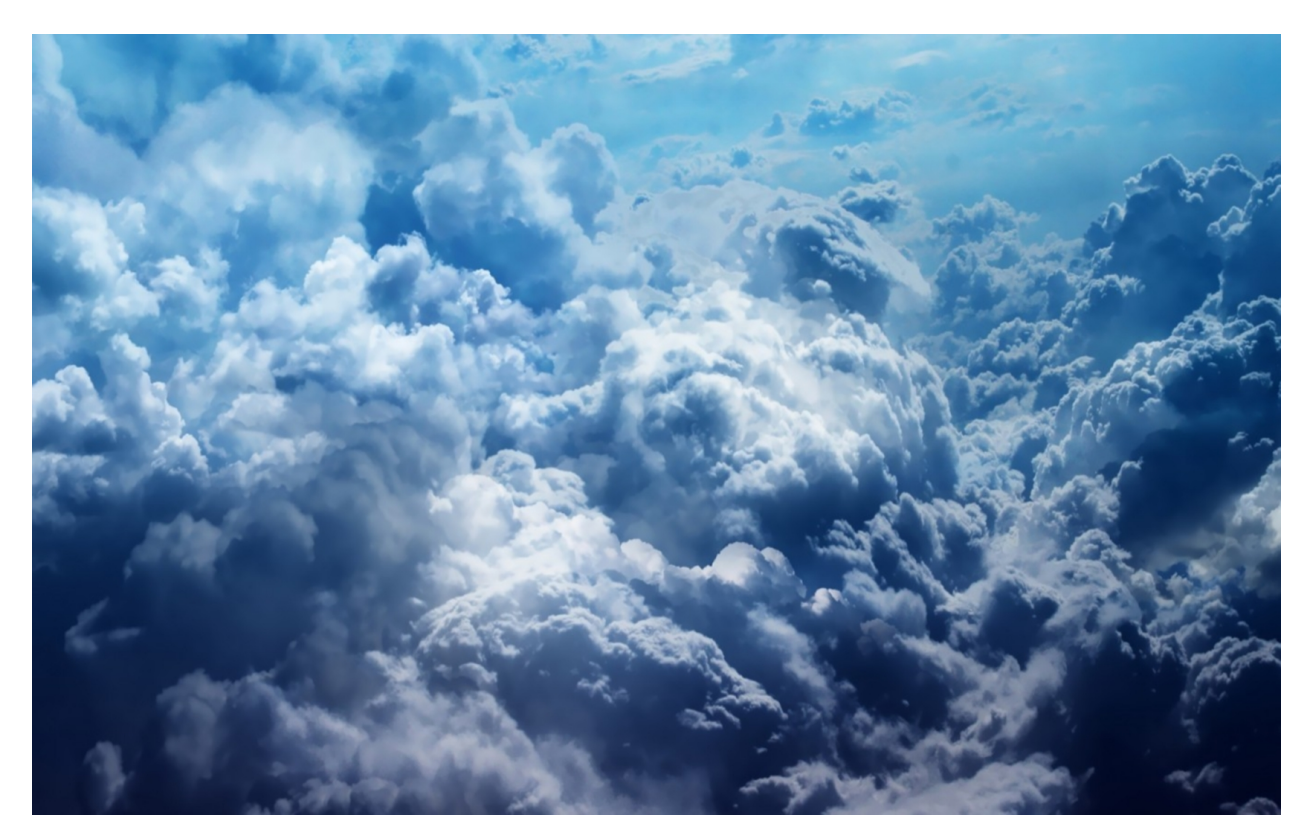
Figure 2: Clouds

An issue contains multiple fields including type, priority, component, status, resolution, description assignee and reporter. It contains information indicating the urgency and current status of the issue. Some of the options available for issue status field include new, to-do, in progress, hold, and closed. Issue priorities vary from trivial to blocker. Classifying issues correctly is essential for users to document their work and reference in the future. Issues can have subtasks, be duplicated or be related to other existing issues. Watching an issue notified the user when the issue is commented, status changed, closed, or updated.