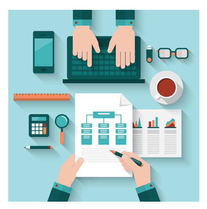
Figure 10: Good Looking Report

Another benefit from connecting JIRA to Confluence is delegated user management to JIRA , so all users can be managed in a single location. Whenever a link is created to a JIRA issue in Confluence, or link to a Confluence page from a JIRA application, the JIRA Links button appears at the top of the Confluence page. This makes it very simple to jump from JIRA straight into Confluence and vice-versa.