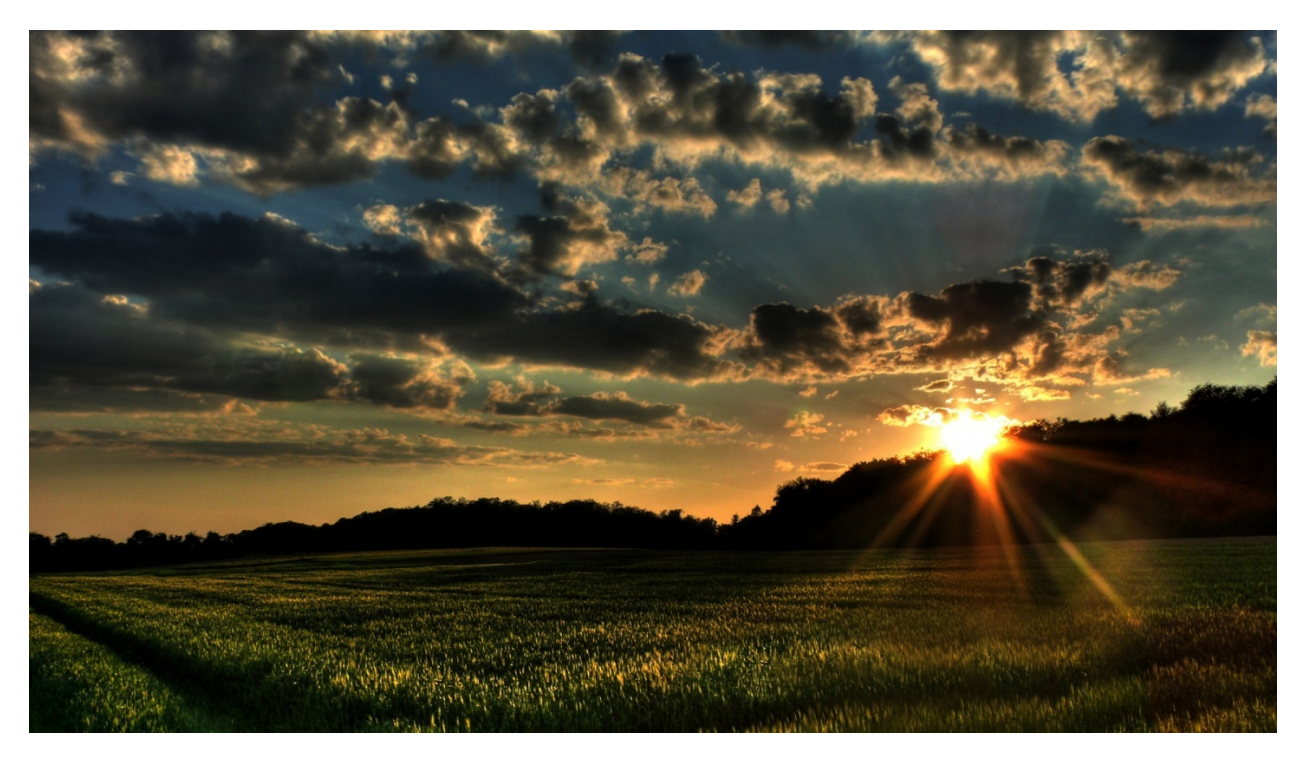
Figure 5: Typical Pictures

conversations with stakeholders as software is developed through collaboration. Two kinds of agile boards are available in JIRA Agile, Kanban and Scrum. Each of these boards are designed to follow their specific agile methodology. Adding the fix version field to an issue will assign it to a particular release. All released and unreleased versions can be viewed within the project sidebar in JIRA. JIRA software provides tools specifically for any agile project management which include boards, releases and dashboard gadgets (burndown charts, velocity charts and more).