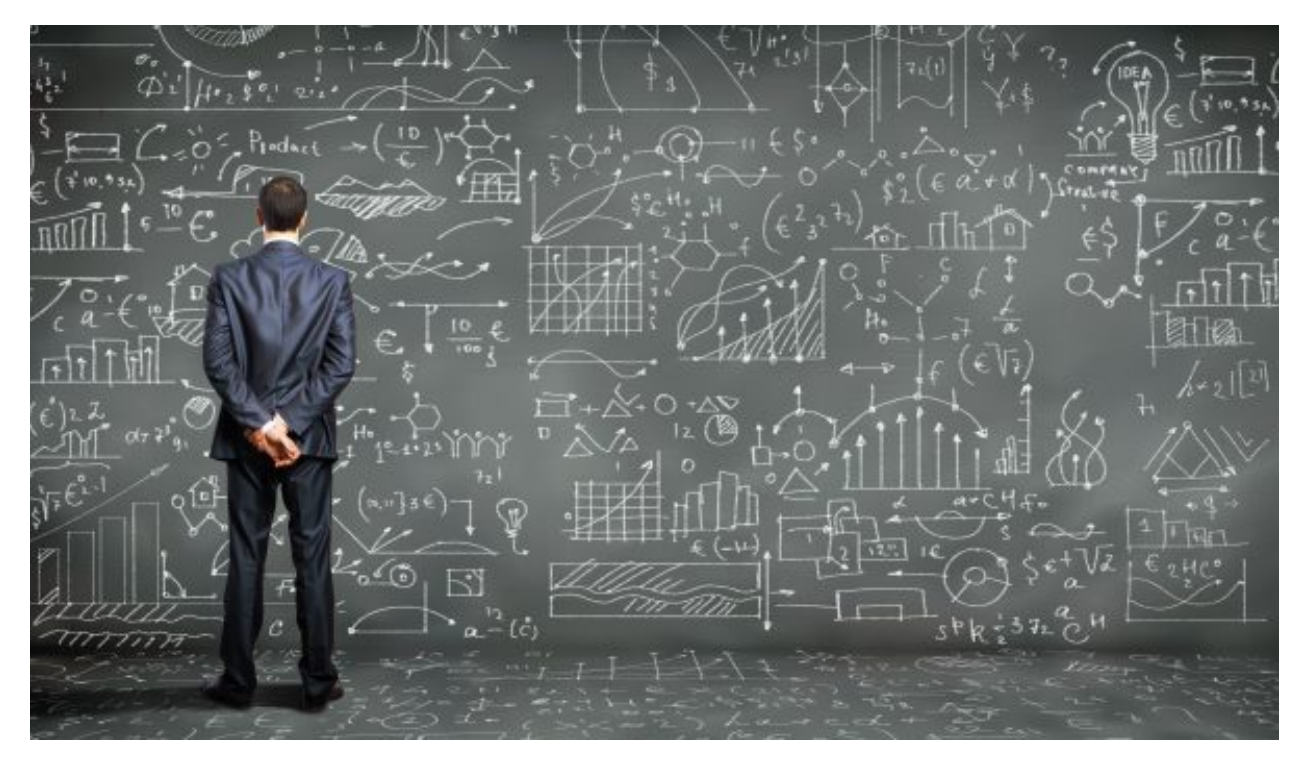
Figure 3: People

JIRA dashboards contains information boxes known as gadgets that can display dynamic data about a JIRA filter or project. Gadgets let you customize the information that appears on dashboards. Configuring dashboards allows different kinds of information to be displayed. Most of these gadgets require JIRA filters to feed information into it. Dashboards can display filter results, issue statistics, pie charts grouped by a specified issue field such as created, assignee, status, and priority. Add-ons for JIRA should as Zephyr (used for test management) and Tempo Timesheets (creates timesheets for JIRA issues) are packaged with dashboard gadgets containing additional information specific to that add on. An example is the user timesheet add-on from tempo which displays a timesheet for a specific period of time.