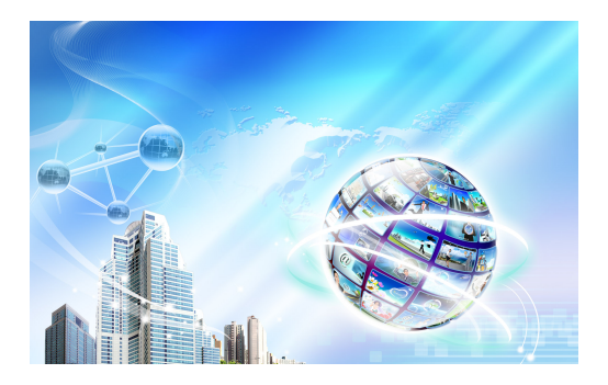
Figure 6: Final Pictures

Tempo timesheets enhances time tracking and reporting features while faultlessly integrating with JIRA. It helps teams and managers track time, be efficient and used for forecasting. This add-on is useful because it allows JIRA users to accurate track their time spent on issues, projects and make strategic decisions based on this info. The tempo time tracker runs within JIRA and is the best way track time.