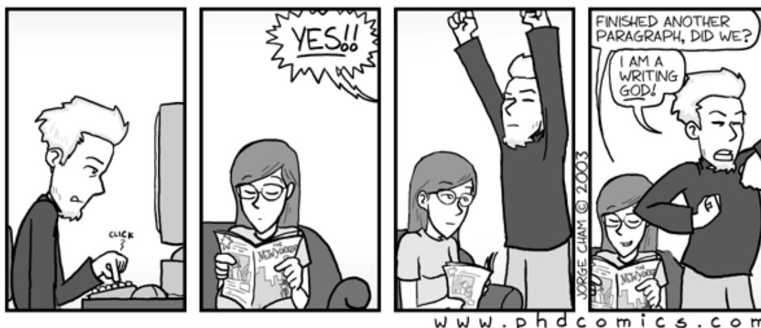
Figure 2.2: A Thesis Writing Comic (from www.phdcomics.com ).

keyword – Used to highlight keywords. For example, this is somekeyword (the command that produces this output is \keyword{somekeyword} ).