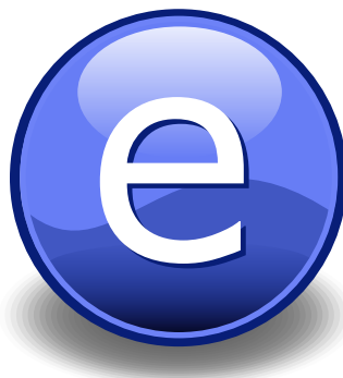
Figure 2.1: An electron (artist's impression).

There are some additional commands created to keep the formatting separated from the content, which we document below.