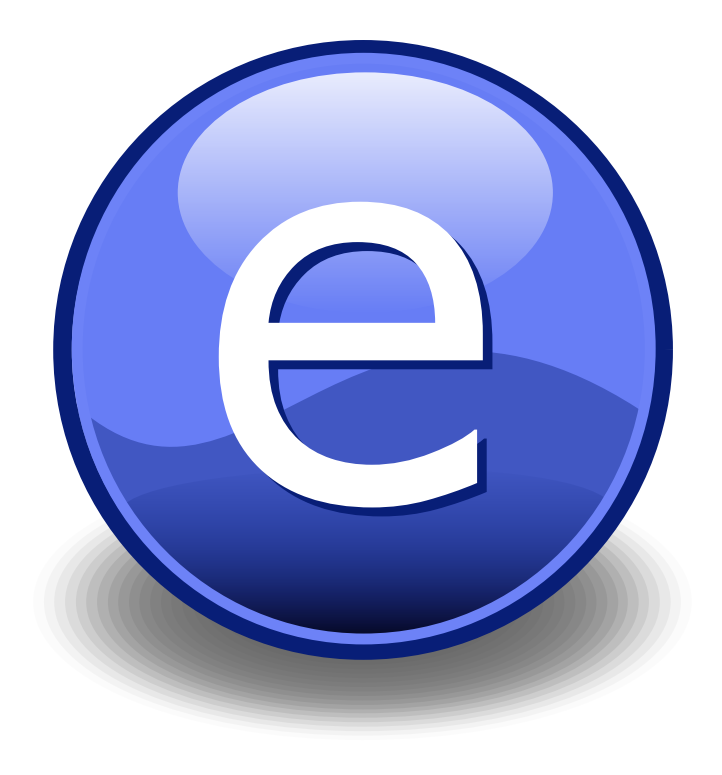
FIGURE 1.1: An electron (artist's impression).

Also look in the source file. Putting this code into the source file produces the picture of the electron that you can see in the figure below.