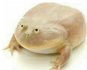
Figure 3: This frog was uploaded to writeLaTeX via the project menu.