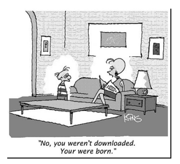
Figura 1. A typical figure

Figure and table captions should be centered if less than one line (Figure 1), otherwise justified and indented by 0.8cm on both margins, as shown in Figure 2. The caption font must be Helvetica, 10 point, boldface, with 6 points of space before and after each caption.