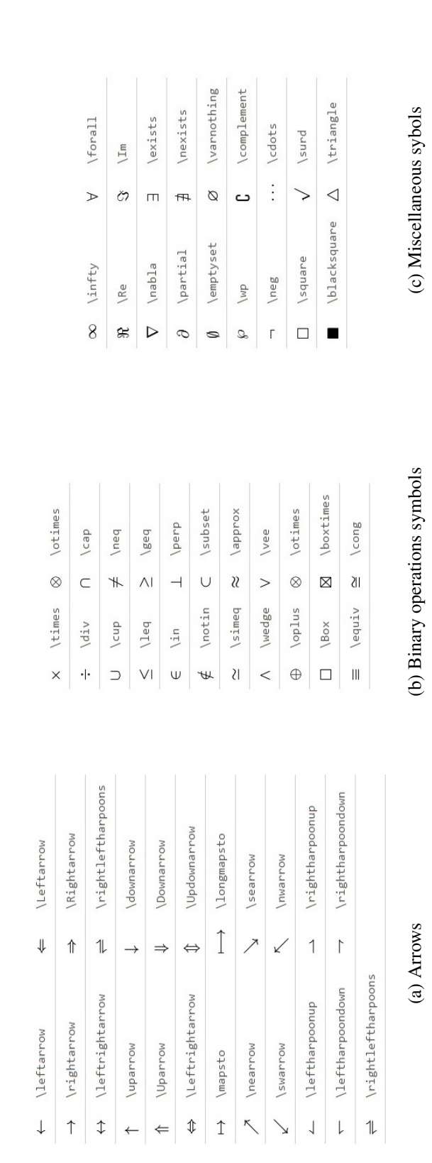
Fig. 2.2 Useful math symbols in Latex