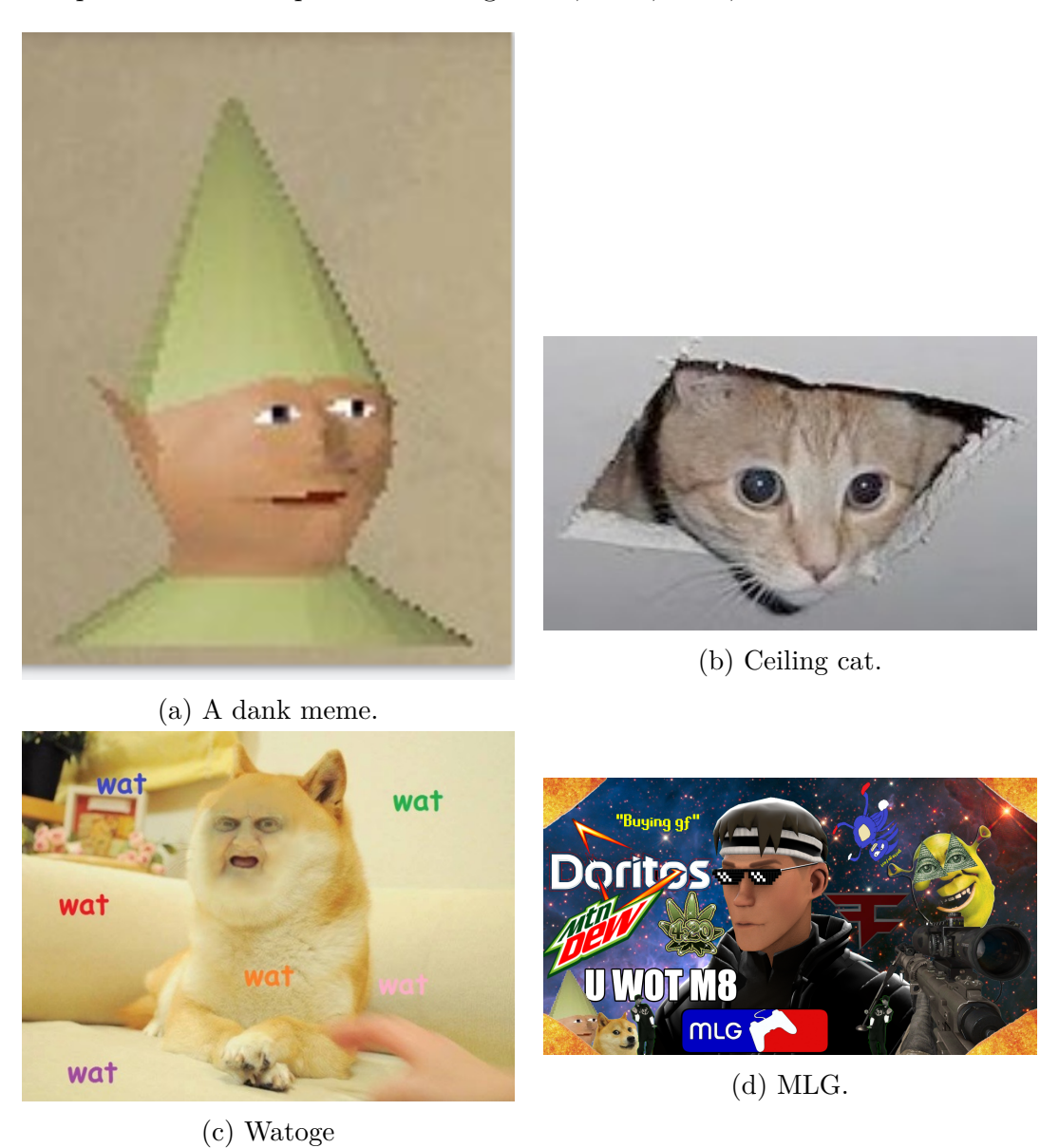
Figure E.1: Pictures of memes.

Which produces the output found in figs. E.1, E.1a, E.1b, E.1c and E.1d: