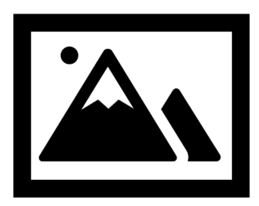
Figure 1: This is an example figure.

Figures should be displayed on a white background. When preparing figures, consider that they can occupy either a single column (half page width) or two columns (full page width), and should be sized accordingly.