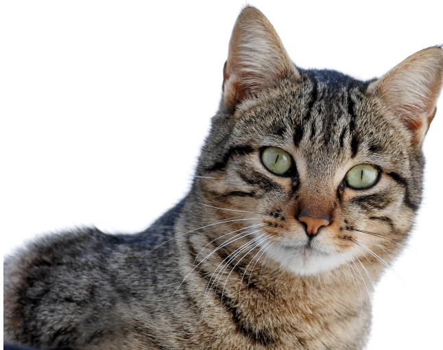
Figure 2.1: A cat looking towards us

An image, inserted as a figure allows you to give it a name and a label to which you may later refer to it.