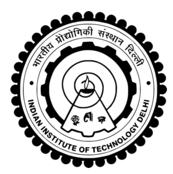
Figure 2.2: using image from current working directory