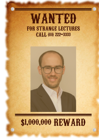
Fig. 1. Who knows that guy?

Figures and plots can be inserted using the \includegraphics[[]]{} command which is normally encapsulated within a floating area defined by