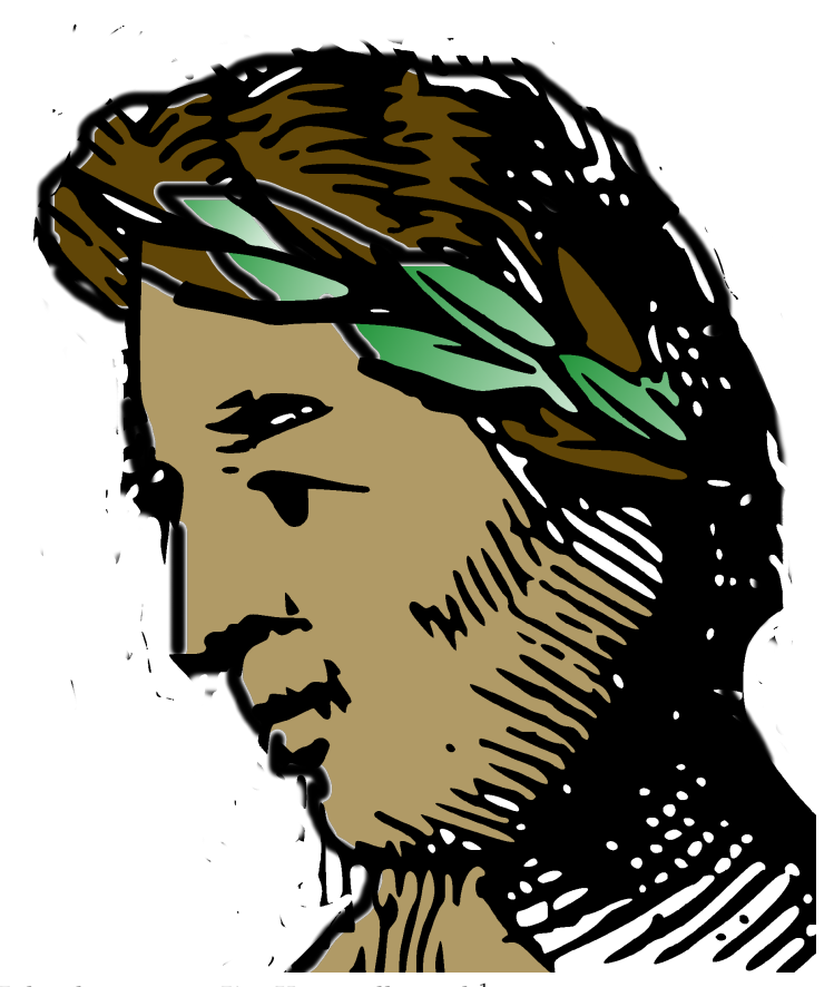
Like shown in 1, \LaTeX is really cool.<sup>1</sup>

gegeben, wobei n für die Zahl der Ecken des Polygons steht.