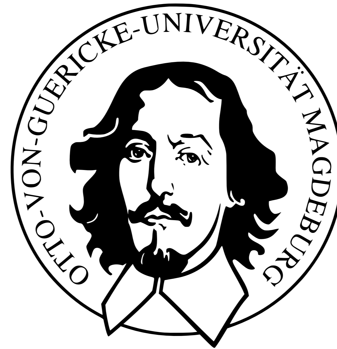
Figure 1: Logo of the university.